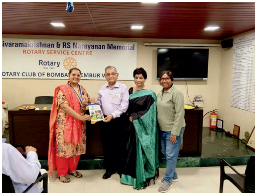
Attended weekly meeting of Rotary club at Chembur Mumbai (Dist - 3141) Warm hospitality

The inauguration of this mission held on 4th February 2026 at 10:00 AM at Maniabandha, Buddha Vihar. For effective on-the-spot service delivery, we have arranged three mobile eye vans, including our Rotary Vision Care Mobile Van, ten eye-care teams, and an adequate stock of eyeglasses.